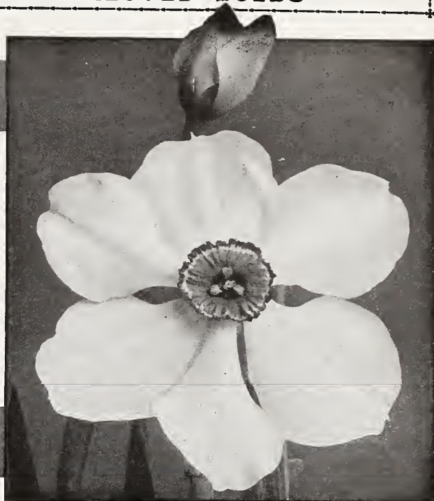
Narcissus Poeticus, King Edward VII